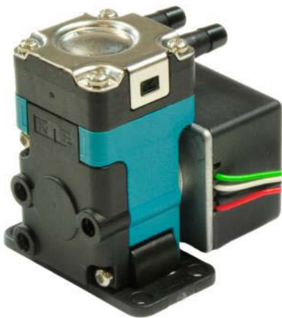
FF 12 DCB-4